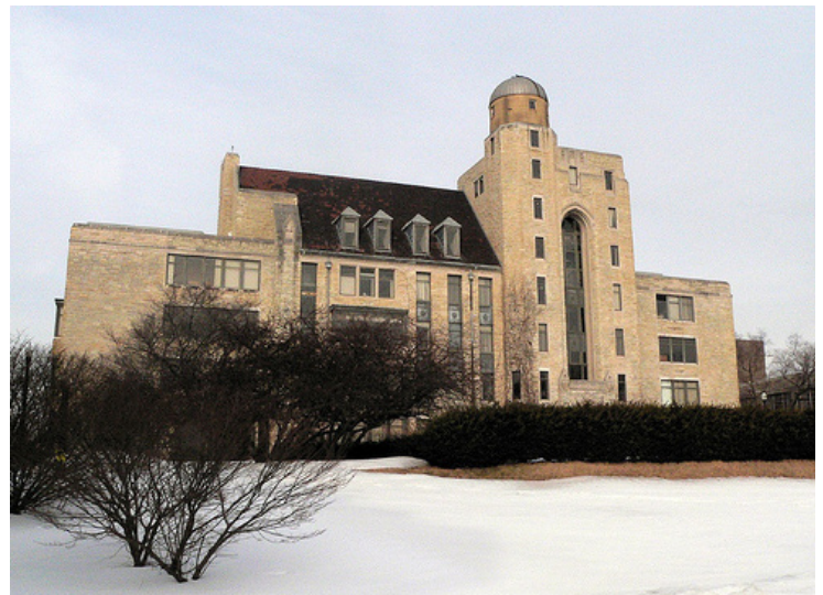
Northern Illinois University